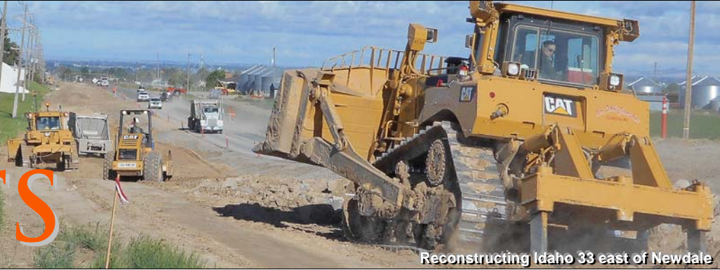
Reconstructing Idaho 33 east of Newdale