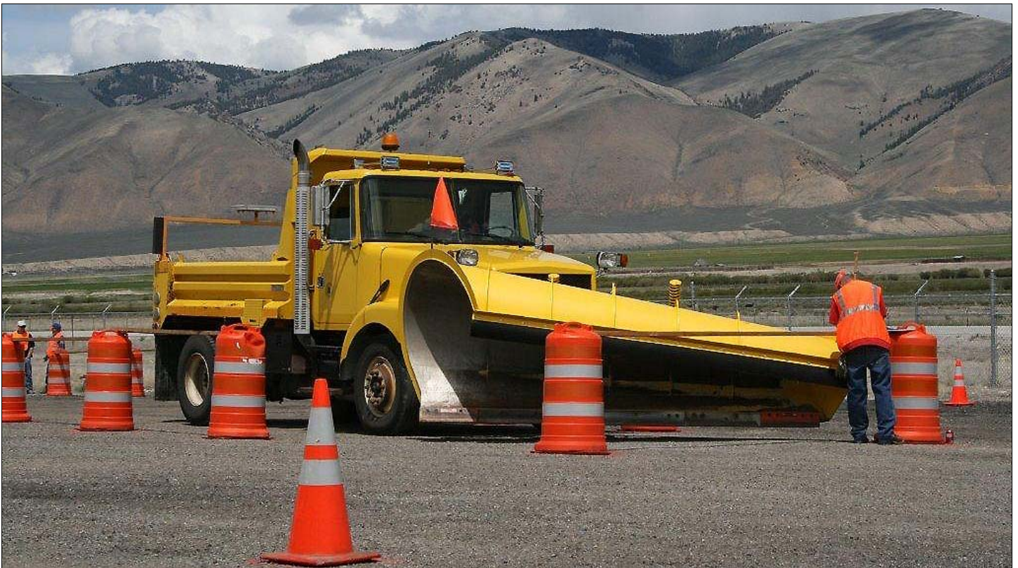
With the day cool and calm following a day of rainfall that settled the dust, conditions were ideal for the annual District 6 roдео.