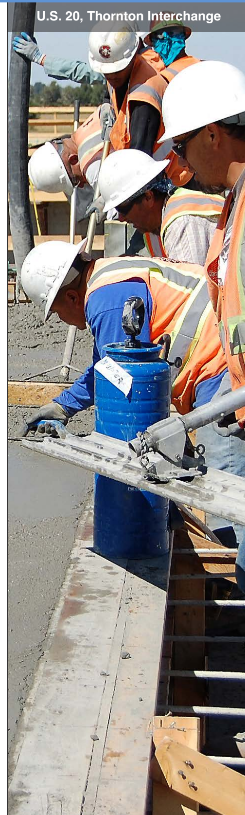
U.S. 20, Thornton Interchange