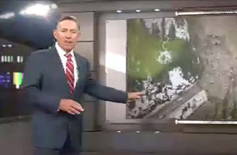
Hwy 14 Opens after Feb. Landslide 10:09 KTVB 7