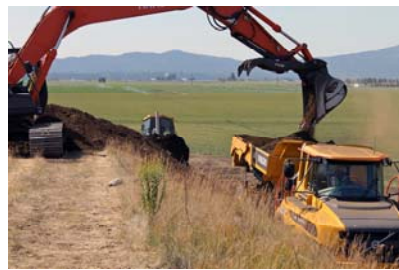
Tasty little action shots from last year's ITD Heavy Equipment Operator (HEO) Training program, which was held in Northern Idaho.