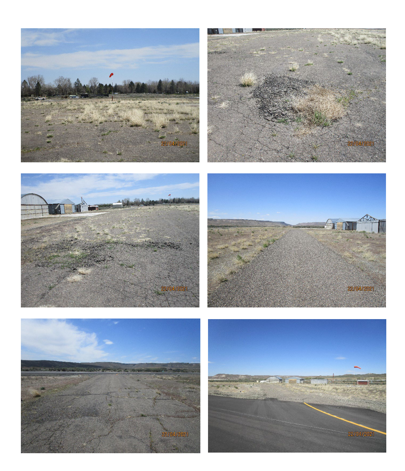
<u>Windsock/Standard/Segmented Circle:</u> The windsock and standard at rwy end 26 are both in good condition. The non-standard segmented circle made up of tires was good and clear of vegetation. The white paint on the standard seems to be holding up, however the orange paint is fading. The wind T was in decent shape and operational as well. Paint on the sheet metal segments and tires was good and visible from the air.