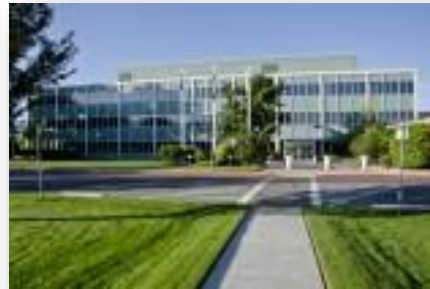
Idaho Transportation Department Headquarters Building Boise, Idaho