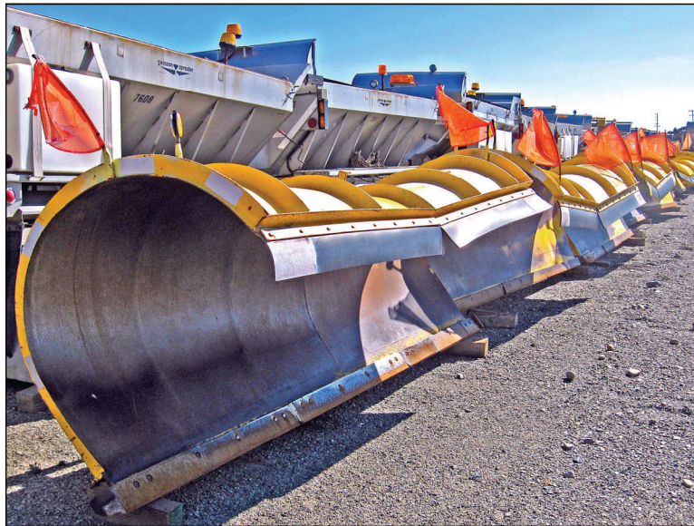
Sand beds and snow plows ... a beautiful sight to some and the signal to a long winter to others. Just necessary gear for ITD snow plow drivers.

"The main thing is if you see the next road section needs help ... contact the