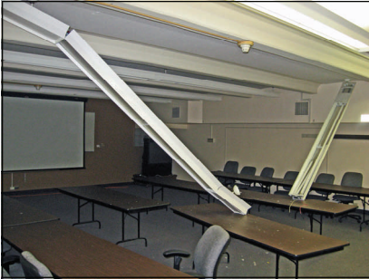
Lucky this didn't happen during the Winter Start-up meeting. The lights in the HQ EOC took a tumble only a couple days later.