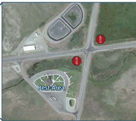
Looking West on US 20