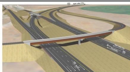
3D Perspective Looking Southeast