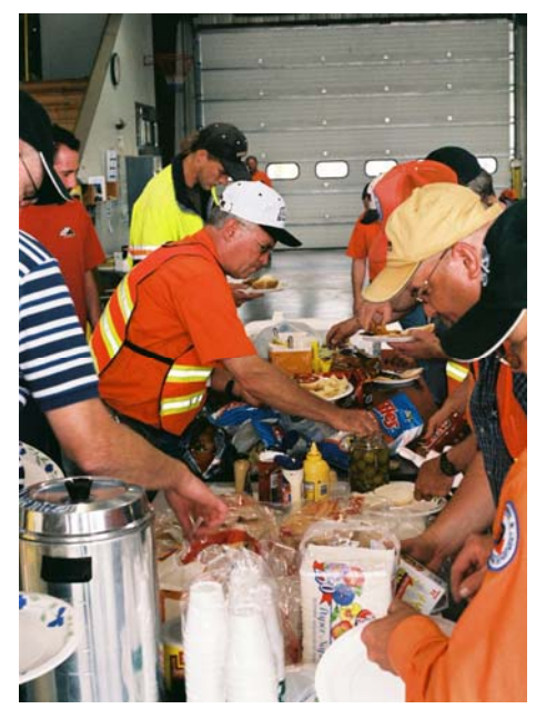
Lunch in the I.F. maintenance shed.