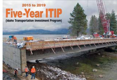
Curious to see our big Master Plan of design and construction? Visit www.itd.idaho.gov and click on the icon shown above for our five-year project list.

After clicking on individual project names, you can view plan holders or addenda, and of course download plans