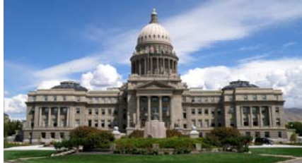
Idaho Statehouse in Boise

H0347 SALES AND USE TAX Amends existing law to exempt certain hand tools up to $100 from the sales and use tax and to remove reference to a definition.