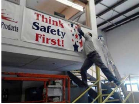
Another great moment in workplace safety! (Before you laugh, you might want to check on what your own employees are doing.)

Local highway agencies, small and large contractors in the construction and general industry, plus professional technical educators and anyone who desires to improve the safety performance of their business are all invited to attend.