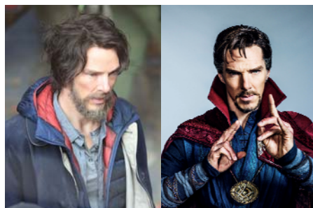
"Before" and "After": a satisfied B2GNow User

"... before B2GNow I barely had time to get home and make dinner for the kids, now I'm managing hedge funds for those kids and serving Soufflé au Chocolat for dessert."*