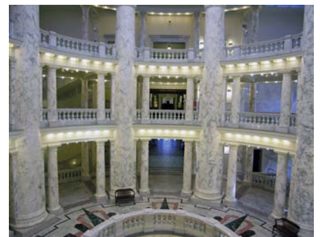
The Idaho Statehouse in Boise, where all the action is (this time of the year, anyway).

S1007 Engineers & Surveyors Amends existing law to provide that the board may require mediation of disputes between professional land surveyors. The purpose is to reduce the prospect of litigation between property owners related to boundary disputes based on differing placement of corners by land surveyors.