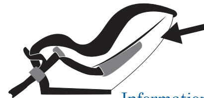
Information Card (where it is not visible while seat is secured in the car)

Fill in all pertinent information on this card (child's name, date of birth, medical history and emergency contacts). To ensure privacy of these personal facts, place it on the back of the safety seat where it will not be visible from outside of the vehicle.