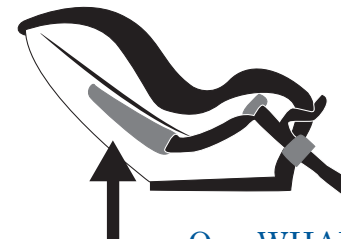
One WHALE™ Sticker On Each Side

These stickers include the WHALE logo and should be attached to the sides of the safety seat so they are easily seen.