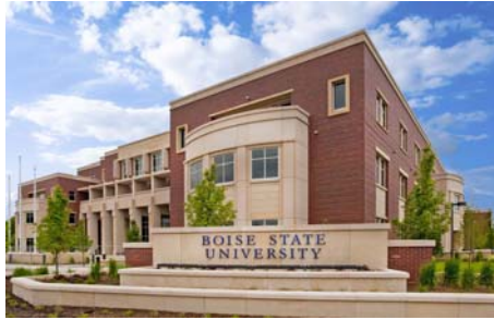
More bucks for BSU. For you out-of-staters, that's the place with the Blue Turf.

FAST is designed to stimulate economic development with outreach and technical assistance to science and technology-driven small businesses, with a particular emphasis on socially and economically disadvantaged firms, helping them to compete in federally-funded research and development through the Small Business Innovation Research (SBIR) and Small Business Technology