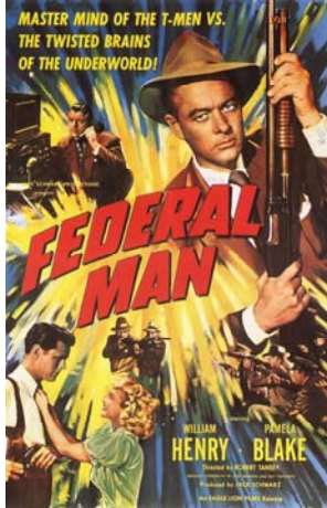
Don't mess around with the Office of Inspector General's Federal Man. Or Federal Woman, as the case may be.

The arrangement was that RAMSCO, a non-DBE, would provide the materials and bill prime contractor ING Civil, Inc.,