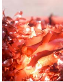
Oregon State University patented a new strain of seaweed that tastes like bacon. Come on, BSU. Get in the game!

After evaluations were made by panels of SBIR program managers, the SBA, the Department of Defense, and the National Science Foundation jointly reviewed panel recommendations and made FAST awards based upon the merits of each proposal.